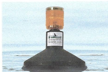
Away With Geese - Water Unit